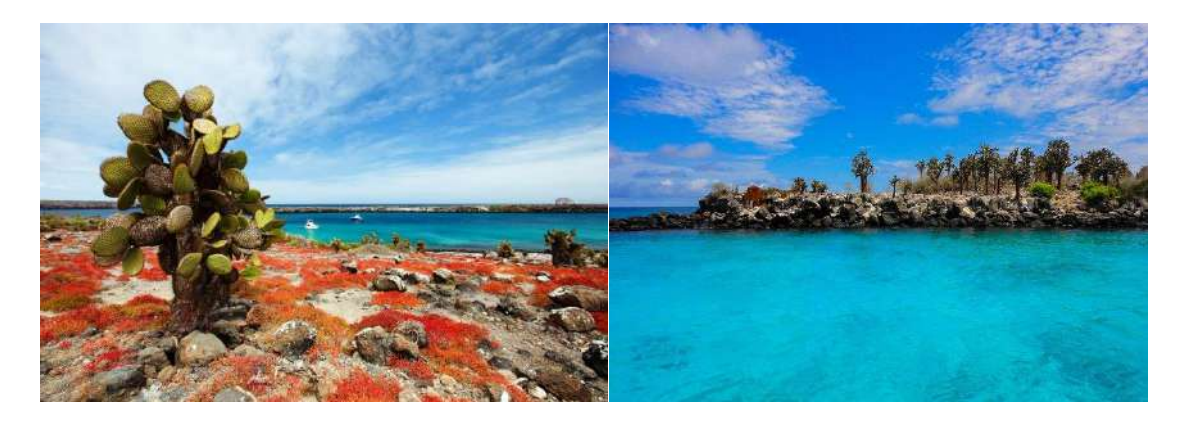
SUNDAY, CHINESE HAT & BARTOLOMÉ AM: CHINESE HAT

making it an unparalleled bird observatory for especially swallow-tailed gulls, shearwaters, and red-billed tropicbirds.