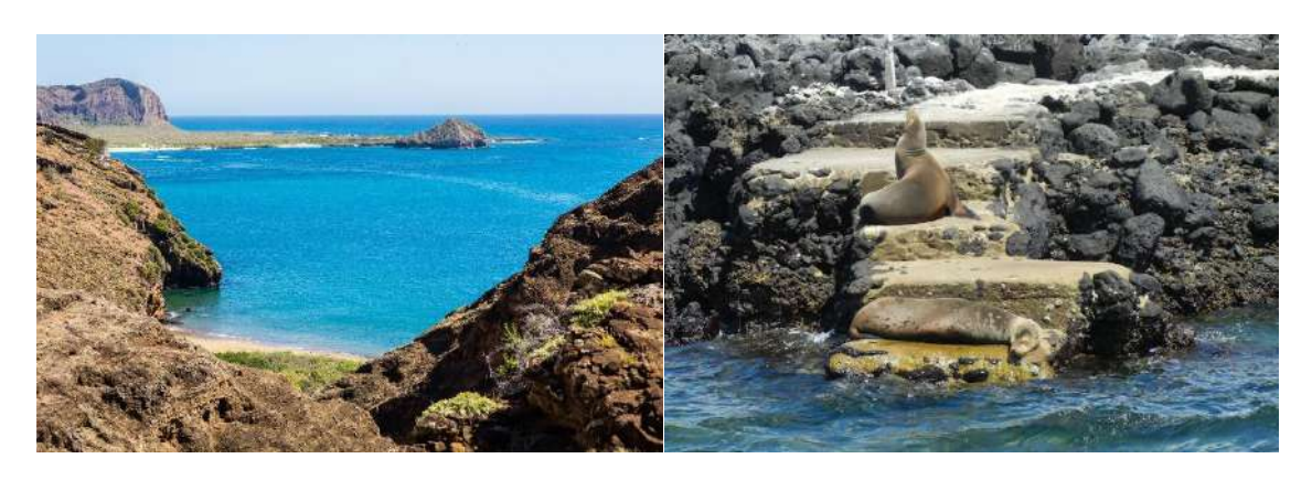
SATURDAY, SANTA FE & PLAZAS AM: BARRINGTON BAY

About 3 and half hours of navigation South we find Isla Lobos were the barking of Galapagos sea lions welcome you to a dry landing. We will walk on over very rocky terrain. To your surprise red balloons will soon bound you, great and magnificent pirates' nests on this small flat Island. Frigate birds with their magenta and green iridescent feathers decorate the saltbushes. The island is also the nesting ground of blue-footed boobies. Don't miss the chance of swimming with sea lions; a few sea creatures are as playful as these marine mammals.